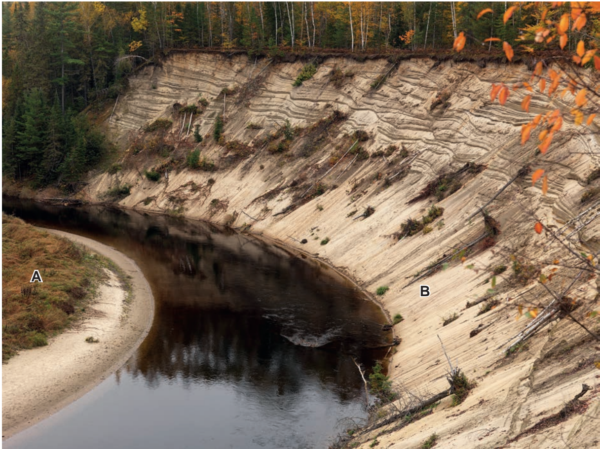
Fig. 5.1 for Question 5